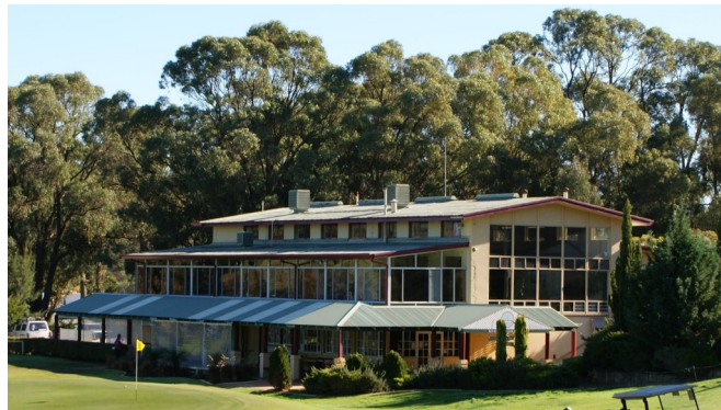
Kwinana Golf Club

Summerton Road, CALISTA 6167 PO Box 3, Kwinana WA 6966 Phone: (08) 9419 2888 Fax: (08) 9439 1393 E-mail: manager@kwinanagolfclub.com.au Web: www.kwinanagolfclub.com.au